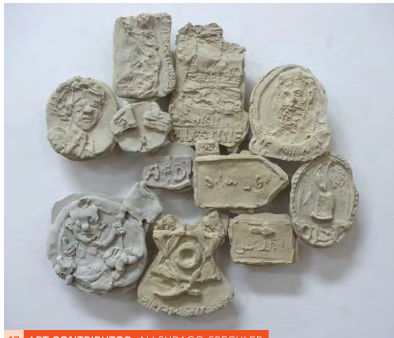
17 ART CONTRIBUTOR: ALI SHRAGO-SPECHLER

Aguna (Chained Woman) , 2010. Hand-built earthenware, painted and glazed. 12.6 x 13.4 x 14.6 in. © 2010 Ruth Schreiber.