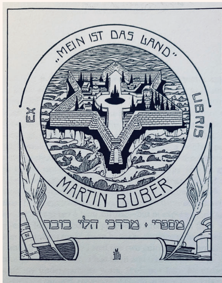
Ephraim Moshe Lilien. Martin Buber Bookplate, 1901.