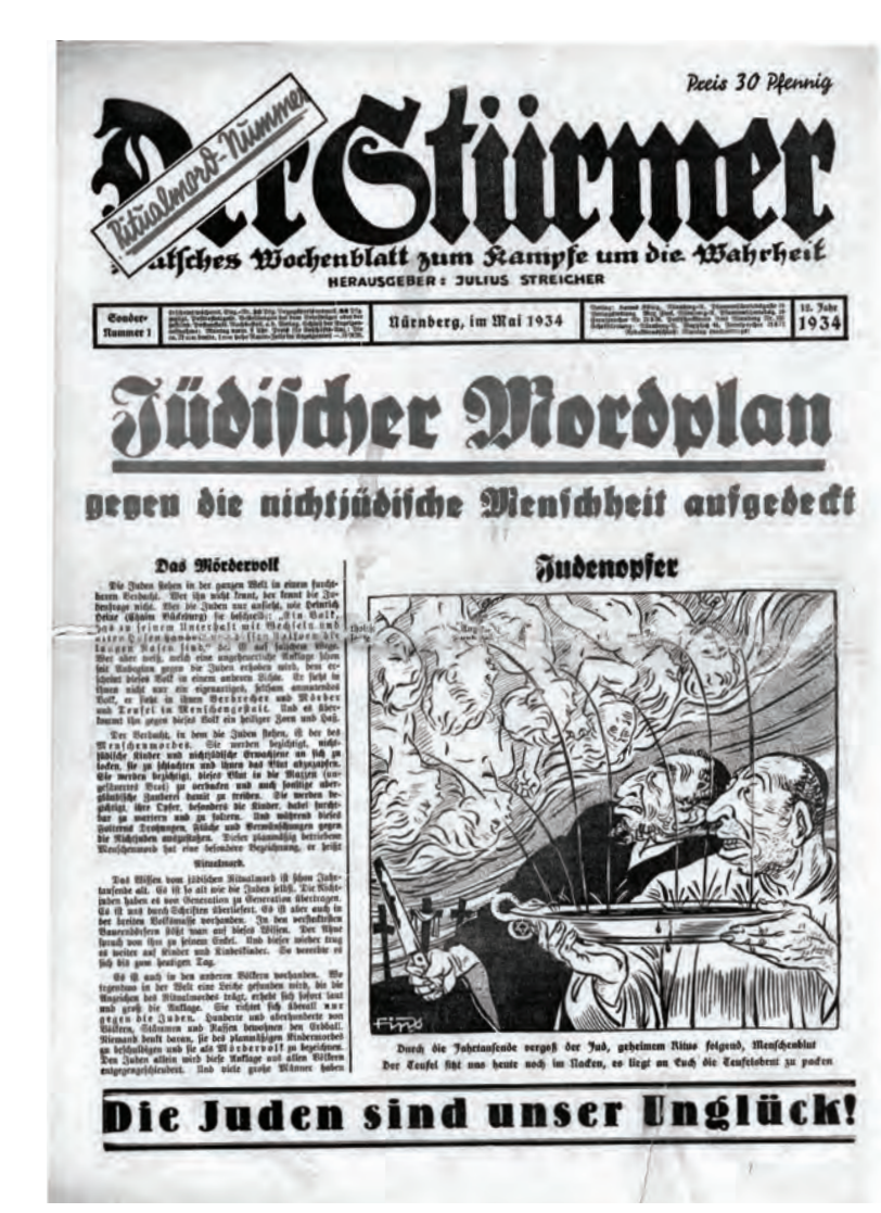
May 1, 1934, issue of Der Stürmer, front page.

And in 1943 the image appeared in a Polish-language Nazi publication on ritual murder, as well as in other languages, as part of the Nazi propaganda during the murderous phase of the "final solution." Frederyk To Gaste, Prawda o żydowskich mordach rytualnych (Warsaw: Glob, 1943).